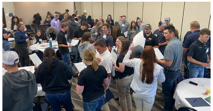
Interns participated in a networking exercise, meeting new colleagues and laying the groundwork for future connections in the cooperative field.