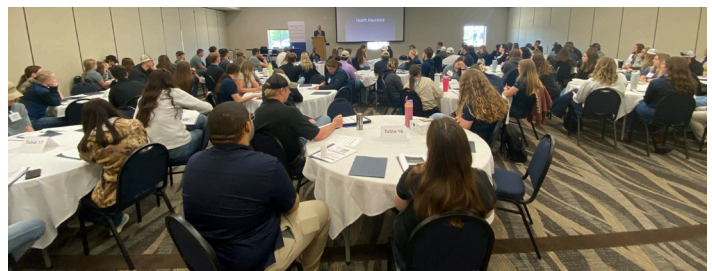
Over 100 student interns participated in Cooperative Intern Day. The conference is designed to give the interns a deeper understanding of the importance of cooperatives and how cooperatives work