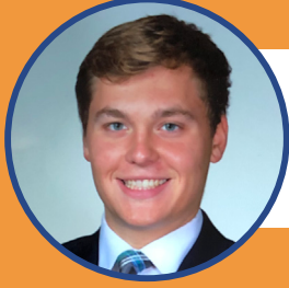
LUKE SOKO AG PROCESSING, INC. Bettendorf, IA